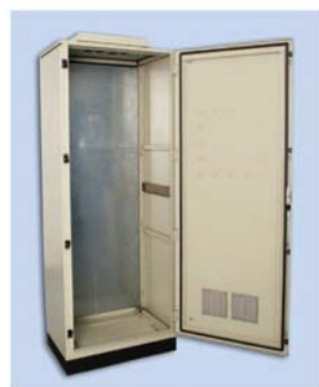
Enclosure with Fan, Filter, Mounting Profile and Roof Ventilation Unit.