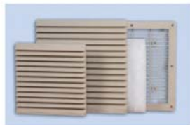
Ventilator Filter Unit