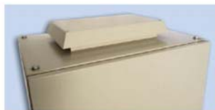
Roof Ventilator Unit