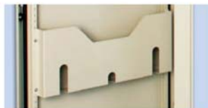
Document Pocket (Metal or Plastic)