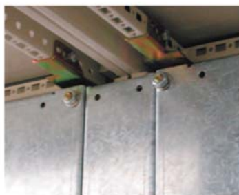
Inner Mounting Plate - 100mm width (to cover gap between 2 mounting plate)