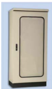
Enclosure with Canopy, Inner Door and Transparent Door