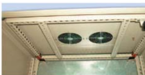
Cooling Fan (single or Double) for Roof Ventilator Unit and Light Mounting Bar