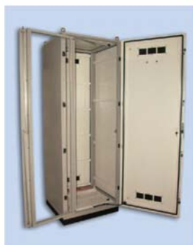
Enclosure with Swing Rack