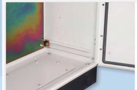
* Bottom internal view