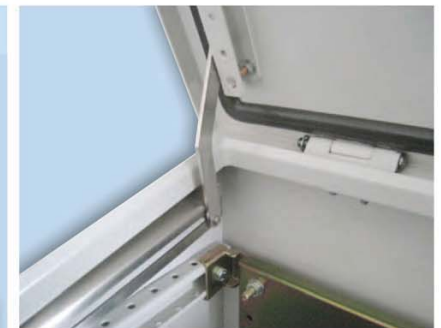
* Top internal view